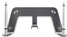
Wall Mountable Kit S30853-H4030-R101