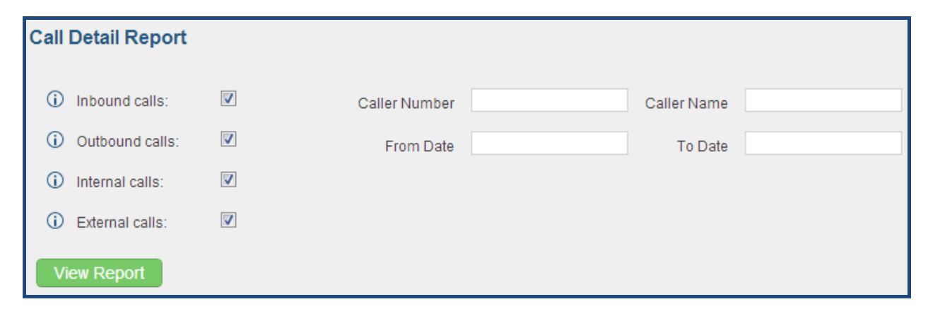
Figure 1: CDR Filter

On the UCM6510, the CDR can be accessed under web UI-> Status -> CDR -> CDR . Users could filter the call report by specifying the date range and criteria, depending on how the users would like to include the logs to the report. Then click on "View Report" button to display the generated report.