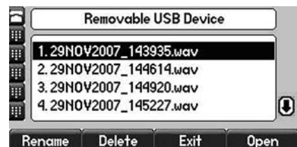
The recording files in .wav format can be played back on the phone or a PC

The Local Call Recording application supports most popular USB drives with up to 2 GB of storage. A list for the tested and approved USB drives is available in a separate technical bulletin on Polycom's support Web site.