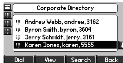
Easily browse and select a contact from an integrated corporate directory on the phone

This application enables any SoundPoint IP phone to connect to an LDAP compliant data store (including Microsoft® Active Directory) that contains all corporate contacts without the need to store them in a separate directory. The benefit of this feature is that it eliminates wasted time associated with maintaining multiple directories. Users can search on first name, last name, or phone number and create a filtered list of contacts to browse, select, and call. They can also opt to store any LDAP contact into their local contact directory. As a result, users can enjoy faster time to connect to their colleagues and business partners.