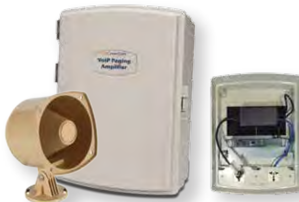
Mini Horn Loudspeaker (part #011068) must be purchased separately.