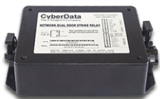
011375 Network Dual Door Strike Relay