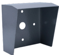
011188 Outdoor Intercom Shroud