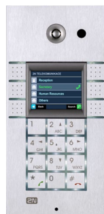
2N® Helios IP Vario