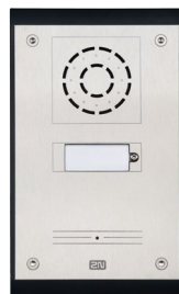
2N® Helios IP Uni

The 2N® Helios IP family is a wide range of door intercoms for every situation - whether in security, business, emergency, or any other special area.