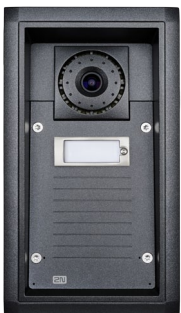
2N® Helios IP Force