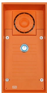
2N® Helios IP Safety