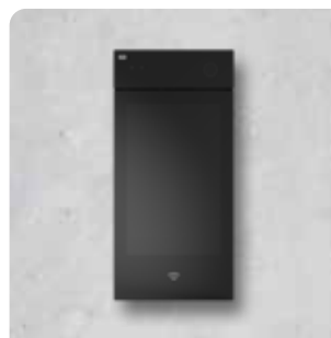
2N® IP STYLE (SUPPORTS SECURED CARDS) 9157101-S