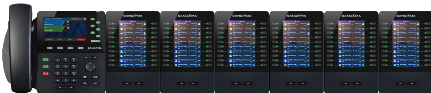
Daisy-chain Up to 6 Modules