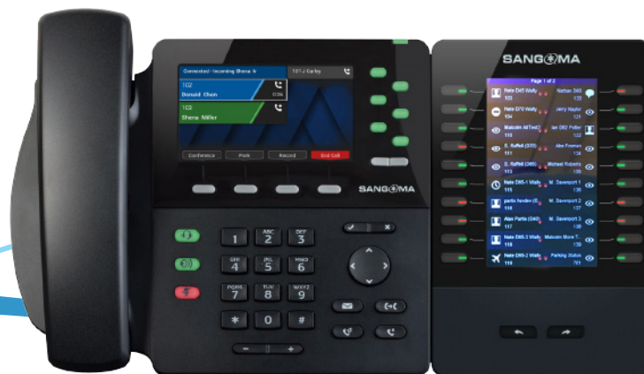
Sangoma IP Phone Sold Separately