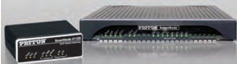
SN4112S & SN4141 Analog Gateway 2 to 8 FXS/FXO ports

Need More Ports? Patton has a full line of analog VoIP gateways!