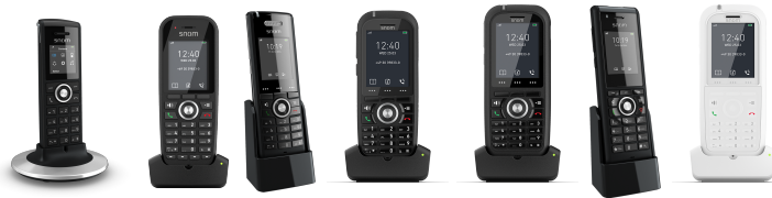
M25 M30 M65 M70 M80 M85 M90