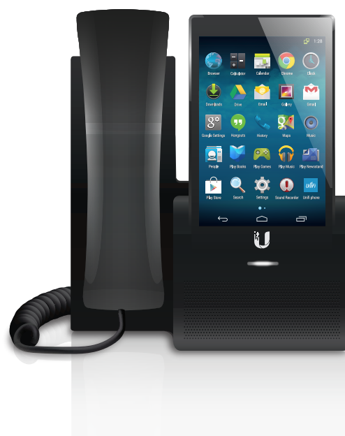
Multi-Touch Color Display

* Touchscreen measurements are diagonal.