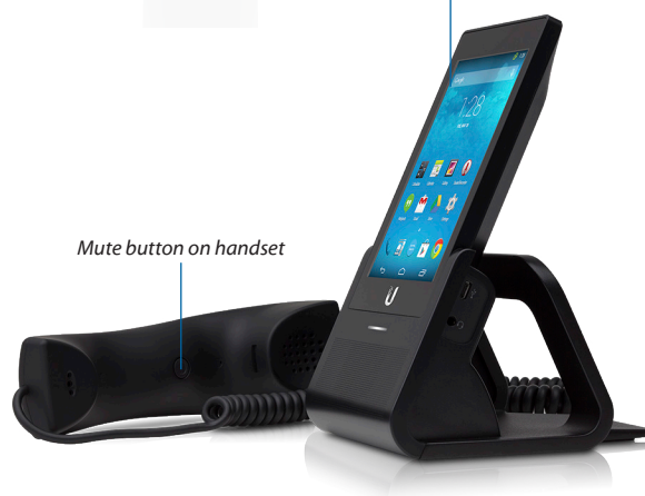
Mute button on handset