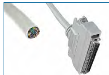
Punch Down Cable

IP/IPX over Frame Relay/ PPP/HDLC/X.25, X.25 over Frame Relay (Annex G), BSC over X.25, SNA over X.25, PPPoE, PPPoA, IP over ATM