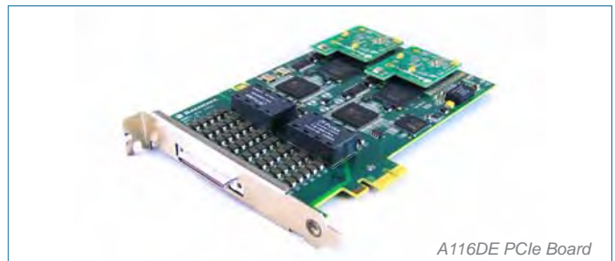
A116DE PCIe Board

Choose the Sangoma A116E and A116DE, equipped with world class DSP hardware to achieve carrier-grade echo cancellation and voice quality enhancement functions for telecommunication systems.