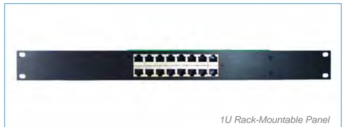
1U Rack-Mountable Panel