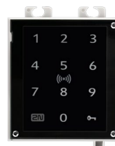
2N® ACCESS UNIT 2.0 TOUCH KEYPAD & RFID ord. 9160336 9160336-S (secured)