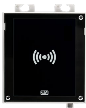
2N® ACCESS UNIT 2.0 RFID ord. 9160334 9160334-S (secured)