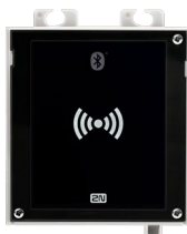
2N® ACCESS UNIT 2.0 BLUETOOTH & RFID ord. 9160335 9160335-S (secured)