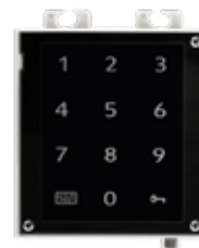
2N® ACCESS UNIT TOUCH KEYPAD