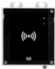
2N® ACCESS UNIT RFID

ord. 916009 (125kHz) ord. 916010 (13.56MHz)