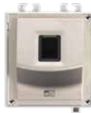
2N® ACCESS UNIT FINGERPRINT READER