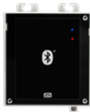
2N® ACCESS UNIT BLUETOOTH

ord. 916009 (125kHz) ord. 916010 (13.56MHz)