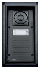
2N® Helios Force

Using the services of the existing analogue exchange not only saves costs on a new solution, but also offers a better quality and wider range of services, e.g. out-of-office redirect (to another office, voicemail, etc.) or putting a call through (e.g. from the secretariat to a particular person).