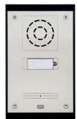
2N® Helios Uni