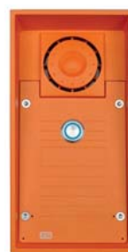
2N® Helios Safety