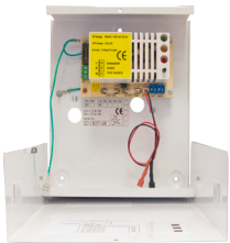
PSU12-1SSM Economy PSU