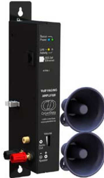
Loudspeakers must be purchased separately.