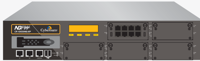
Flexi Ports Module