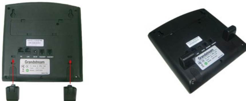
Figure 2: Attach the wall mount spacers to the GXP-1200

To position the phone on the wall, place two fixed hangers on the wall, hang the back of the phone on the fixed hangers.