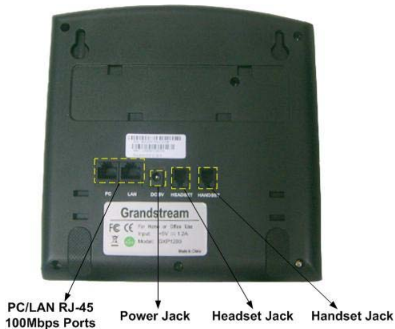
Figure 1: Connectors on the bottom of the GXP-1200