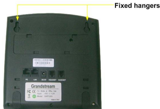
Figure 3: Location of the fixed hangers on GXP-1200

To use the handset, pull out the tab (extension downward) from the handset cradle, rotate the tab and plug it back into the slot with the extension up to hold the handset.