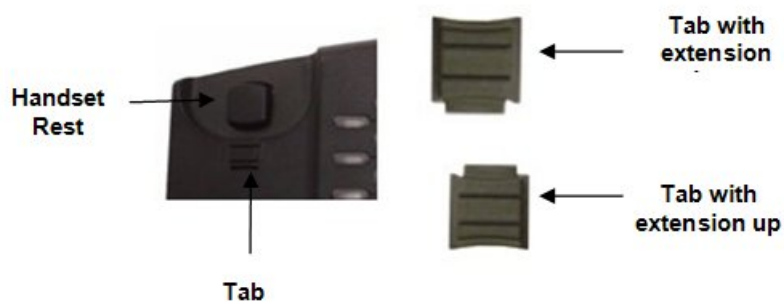
Figure 4: Placing tab for mounting phone to wall

To use the handset, pull out the tab (extension downward) from the handset cradle, rotate the tab and plug it back into the slot with the extension up to hold the handset.