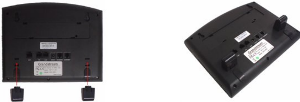
Figure 2: Attach the wall-mount spacers to the GXP-2010

To position the phone on the wall, place two fixed hangers on the wall, hang the back of the phone on the fixed hangers.