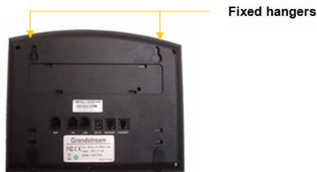
Figure 3: Location of the fixed hangers on GXP-2010

To use the handset, pull out the tab (extension downward) from the handset cradle, rotate the tab and plug it back into the slot with the extension up to hold the handset.