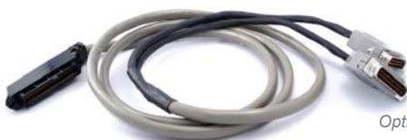
Optional Amphenol-Y Cable