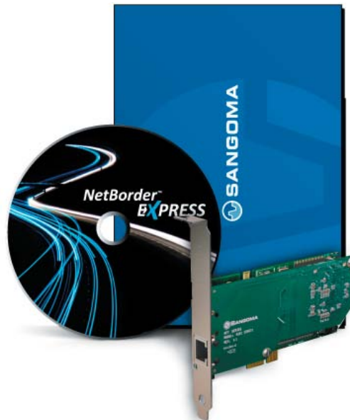
Single Port T1/E1 NetBorder Express Gateway Card with PCI-Express Interface. Supports up to 30 Simultaneous Calls. (Part Number: NBE030FA101DE)

Available in one to eight ports of T1/E1, NetBorder Express Gateway Cards are an excellent value for installations ranging anywhere from 24 to 240 simultaneous calls. For larger systems, several gateway cards can be combined in the same server to support up to 960 simultaneous calls. (Analog and ISDN BRI Gateway cards are coming soon.)