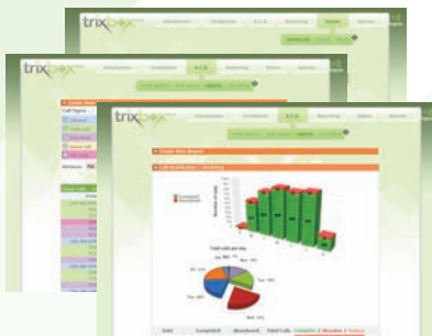
trixbox Pro Control Panel

Get a trixbox Pro phone system preinstalled and fully tested with the box that it was made to run on. trixbox Appliance is the only complete solution designed for trixbox by trixbox. The hand-selected hardware gives you the highest quality phone calls with VoIP, digital, and analog connectivity options.