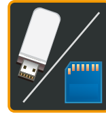
USB & SD